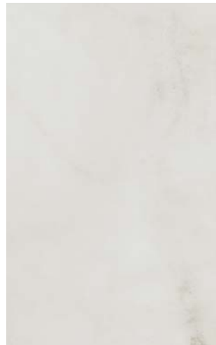
10" x 16" BELLINA CREAM WALL TILE 56-046