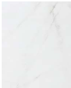
8' x 10' BELLINA GREY WALL TILE 52-166