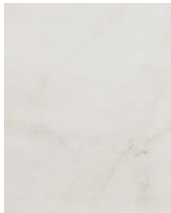
8" x 10" BELLINA CREAM WALL TILE 52-168