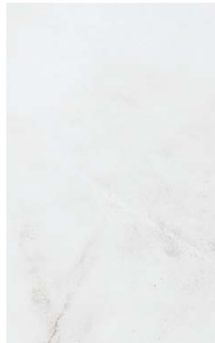
10' x 16' BELLINA GREY WALL TILE 56-044