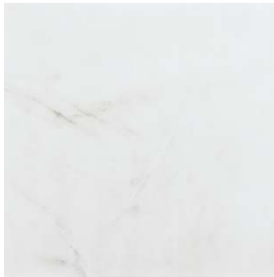
13' x 13' BELLINA GREY FLOOR TILE 46-140