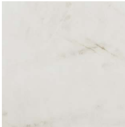
13" x 13" BELLINA CREAM FLOOR TILE 46-142