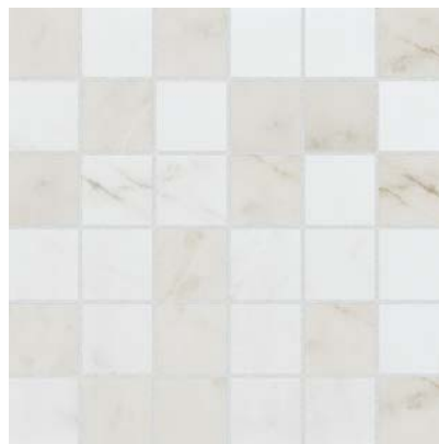
2' x 2' BELLINA MULTI MOSAICS 46-144