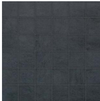
2" x 2" CINQ BLACK MOSAICS 46-154