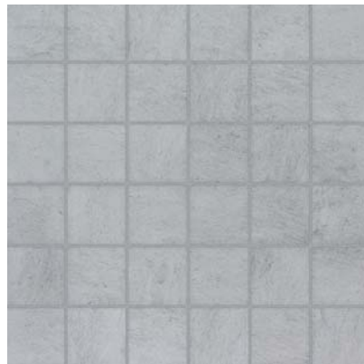
2' x 2' CINQ GREY MOSAICS 46-152