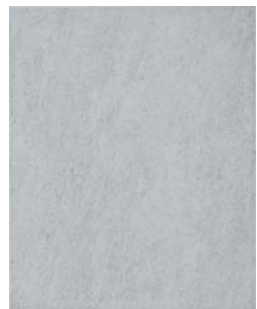
8' x 10' CINQ GREY WALL TILE 52-174