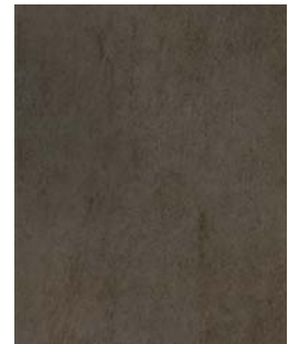
8" x 10" CINQ BROWN WALL TILE 52-176