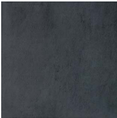
13" x 13" CINQ BLACK FLOOR TILE 46-149