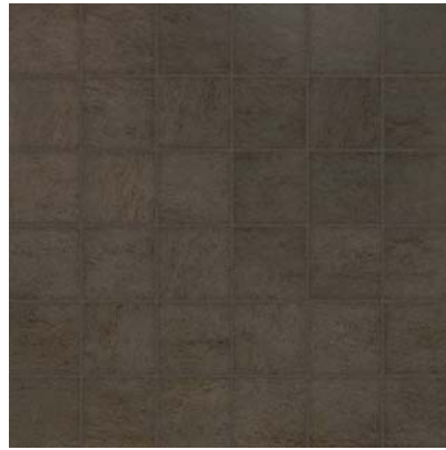
2" x 2" CINQ BROWN MOSAICS 46-153