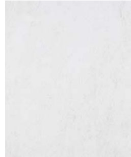
8' x 10' CINQ WHITE WALL TILE 52-170