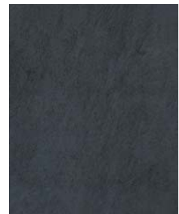
8" x 10" CINQ BLACK WALL TILE 52-178