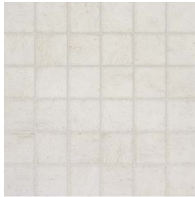
2' x 2' CINQ CREAM MOSAICS 46-151