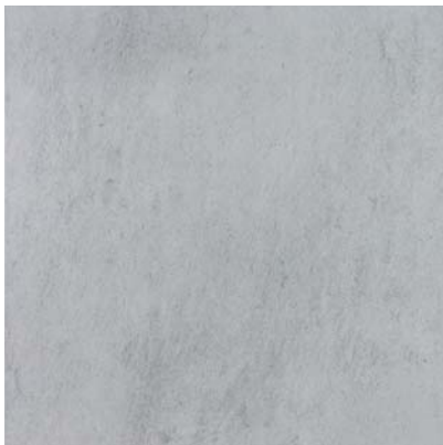
13' x 13' CINQ GREY FLOOR TILE 46-147