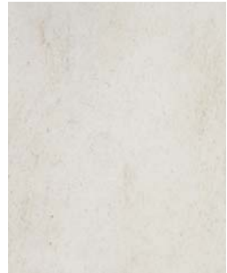
8' x 10' CINQ CREAM WALL TILE 52-172