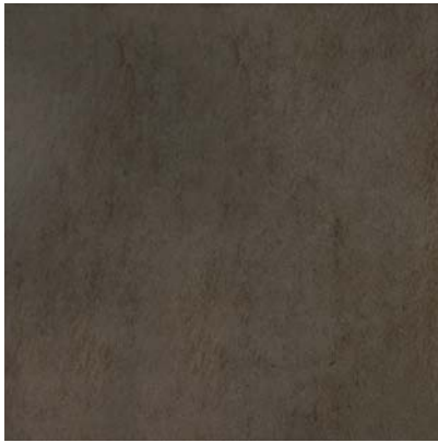
13" x 13" CINQ BROWN FLOOR TILE 46-148