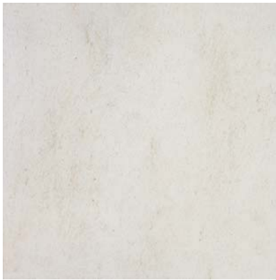
13' x 13' CINQ CREAM FLOOR TILE 46-146