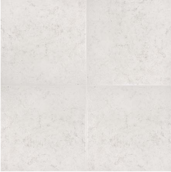
12" x 12" DAKOTA IVORY FLOOR TILE 44-000