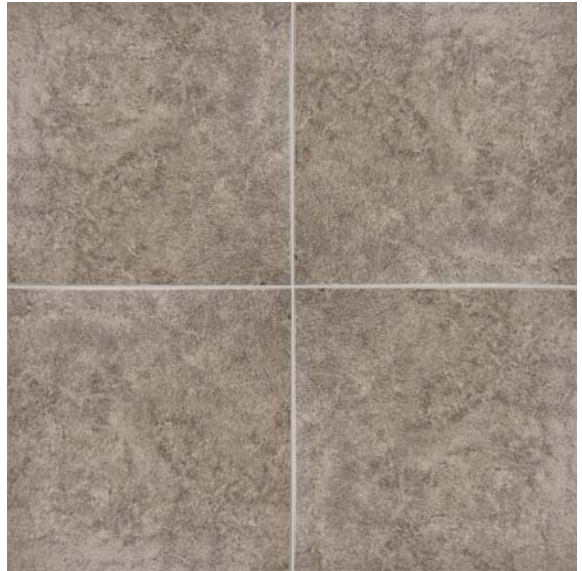
12" x 12" DAKOTA WALNUT FLOOR TILE 44-003