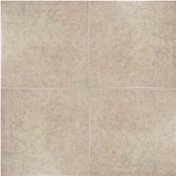
12" x 12" DAKOTA BEIGE FLOOR TILE 44-002