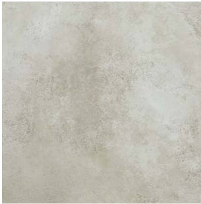
13' x 13' MANTOVA CLASSICO PORCELAIN TILE 63-252