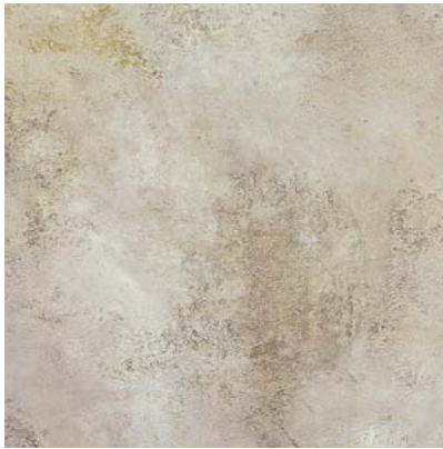
13' x 13' MANTOVA WALNUT PORCELAIN TILE 63-250