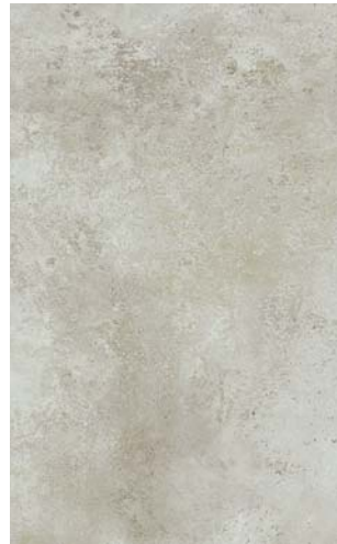
10' x 16' MANTOVA CLASSICO WALL TILE 56-038