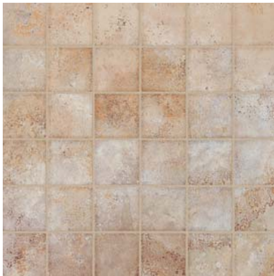
2" x 2" MANTOVA LAVA MOSAICS 63-440