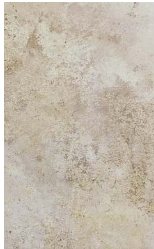
10' x 16' MANTOVA WALNUT WALL TILE 56-036