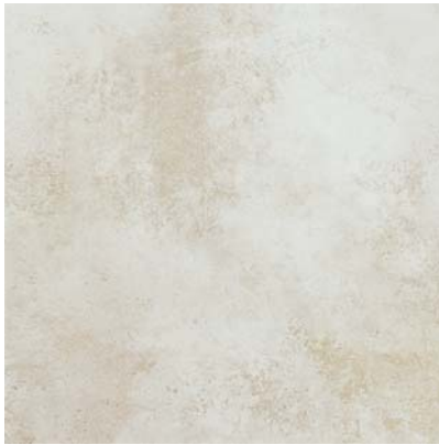
13' x 13' MANTOVA IVORY PORCELAIN TILE 63-248