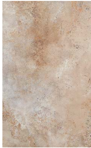
10" x 16" MANTOVA LAVA WALL TILE 56-042