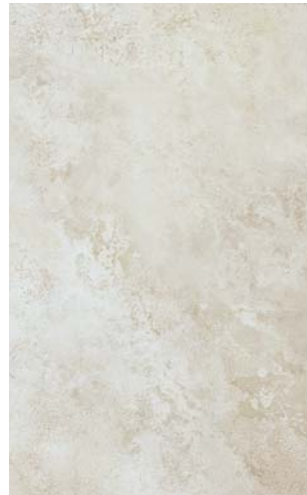
10' x 16' MANTOVA IVORY WALL TILE 56-034