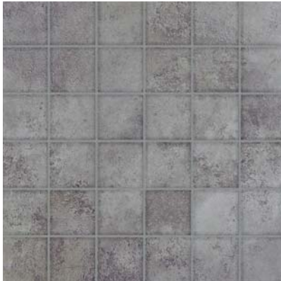
2' x 2' MANTOVA ANTHRACITE MOSAICS 63-439