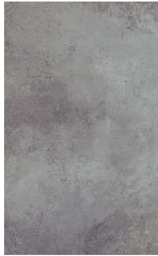
10' x 16' MANTOVA ANTHRACITE WALL TILE 56-040