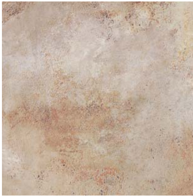
13" x 13" MANTOVA LAVA PORCELAIN TILE 63-256