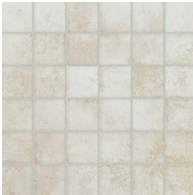
2' x 2' MANTOVA IVORY MOSAICS 63-436