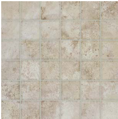
2' x 2' MANTOVA WALNUT MOSAICS 63-437