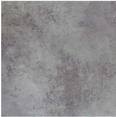
13' x 13' MANTOVA ANTHRACITE PORCELAIN TILE 63-254