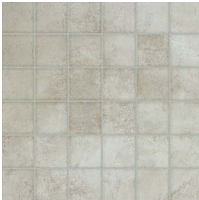
2' x 2' MANTOVA CLASSICO MOSAICS 63-438