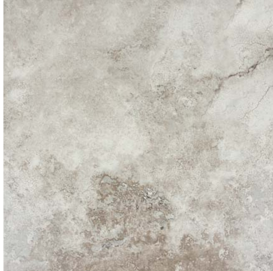
18" x 18" PRATO WALNUT PORCELAIN TILE 49-005