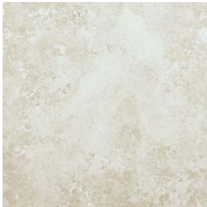
13" x 13" PRATO IVORY PORCELAIN TILE 46-128