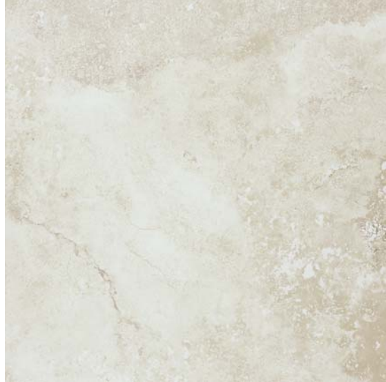
18" x 18" PRATO IVORY PORCELAIN TILE 49-004