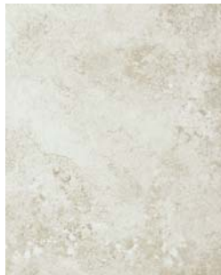
8" x 10" PRATO IVORY WALL TILE 52-158