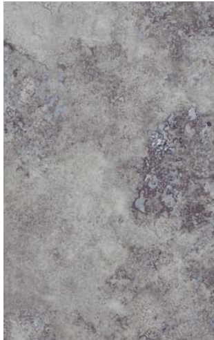
10' x 16' PRATO ANTHRACITE WALL TILE 56-032