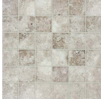
2" x 2" PRATO WALNUT MOSAICS 46-160