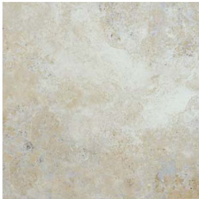
13' x 13' PRATO CLASSICO PORCELAIN TILE 46-132