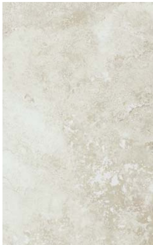
10" x 16" PRATO IVORY WALL TILE 56-026