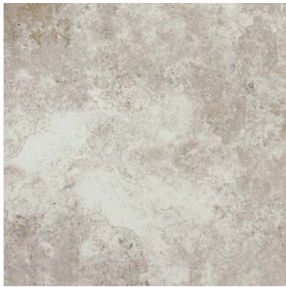
13" x 13" PRATO WALNUT PORCELAIN TILE 46-130