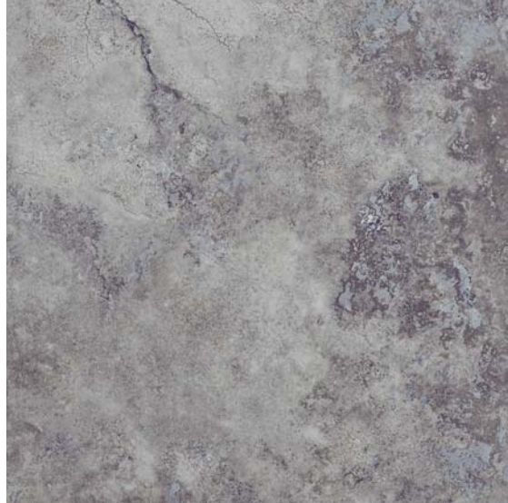
18' x 18' PRATO ANTHRACITE PORCELAIN TILE 49-007