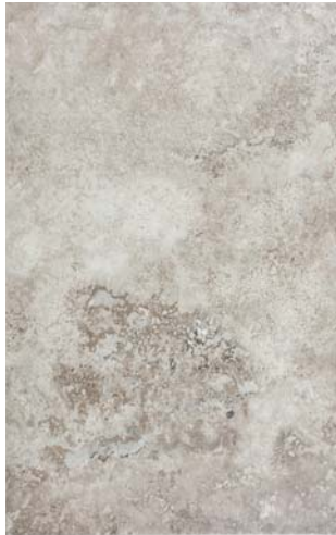
10" x 16" PRATO WALNUT WALL TILE 56-028