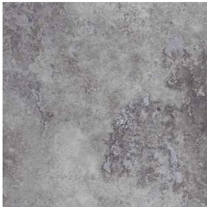
13' x 13' PRATO ANTHRACITE PORCELAIN TILE 46-134