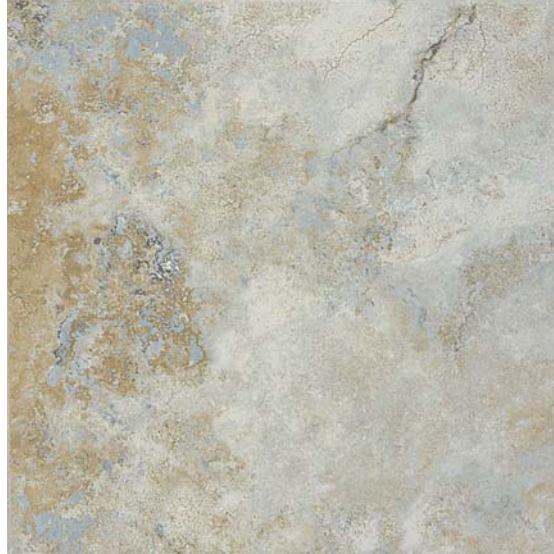
18' x 18' PRATO CLASSICO PORCELAIN TILE 49-006