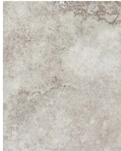
8" x 10" PRATO WALNUT WALL TILE 52-160