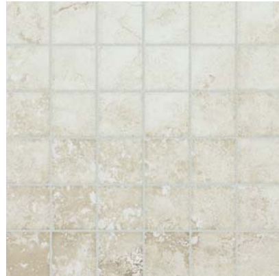
2" x 2" PRATO IVORY MOSAICS 46-159