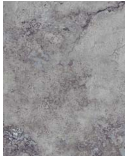
8' x 10' PRATO ANTHRACITE WALL TILE 52-164