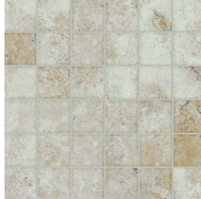
2' x 2' PRATO CLASSICO MOSAICS 46-161