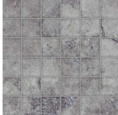
2' x 2' PRATO ANTHRACITE MOSAICS 46-162