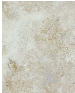
8' x 10' PRATO CLASSICO WALL TILE 52-162